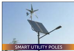
SMART UTILITY POLES