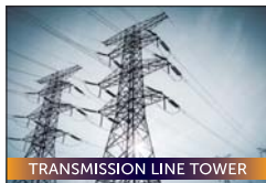
TRANSMISSION LINE TOWER