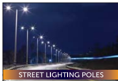
STREET LIGHTING POLES